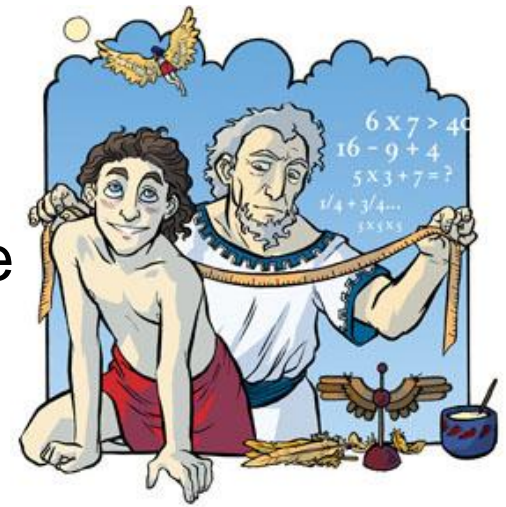
Illustration: Dylan Meconis